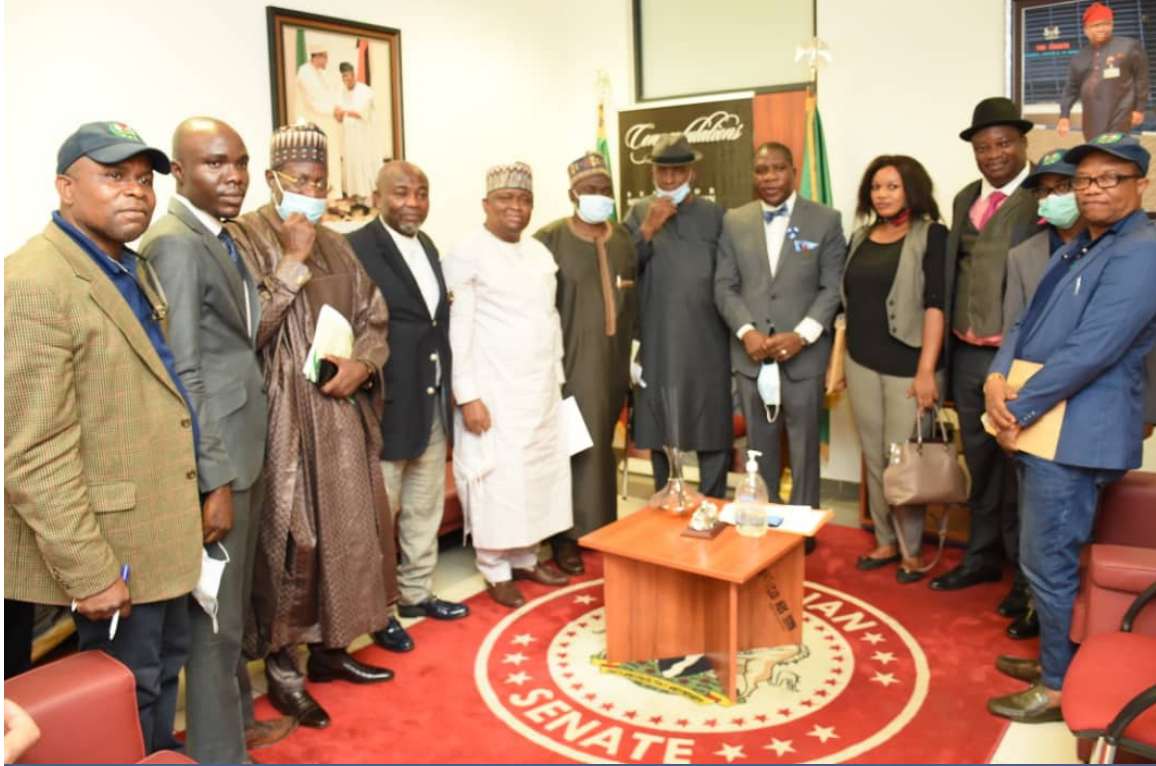
FRC Management Team visit to the Senate Committee on Finance