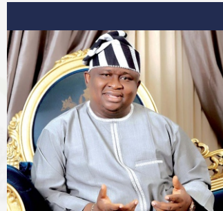
Distinguished Sen. Solomon Adeola